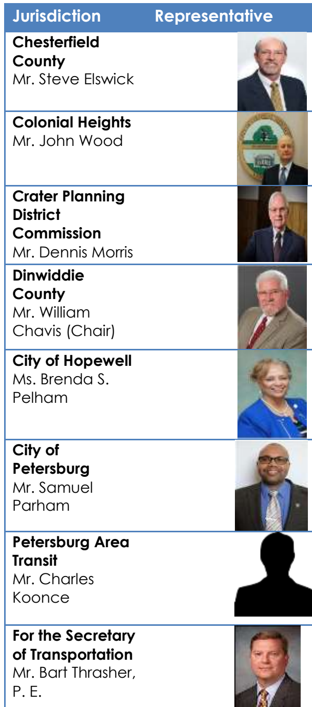
Table 1: Tri-Cities MPO Policy Board Members