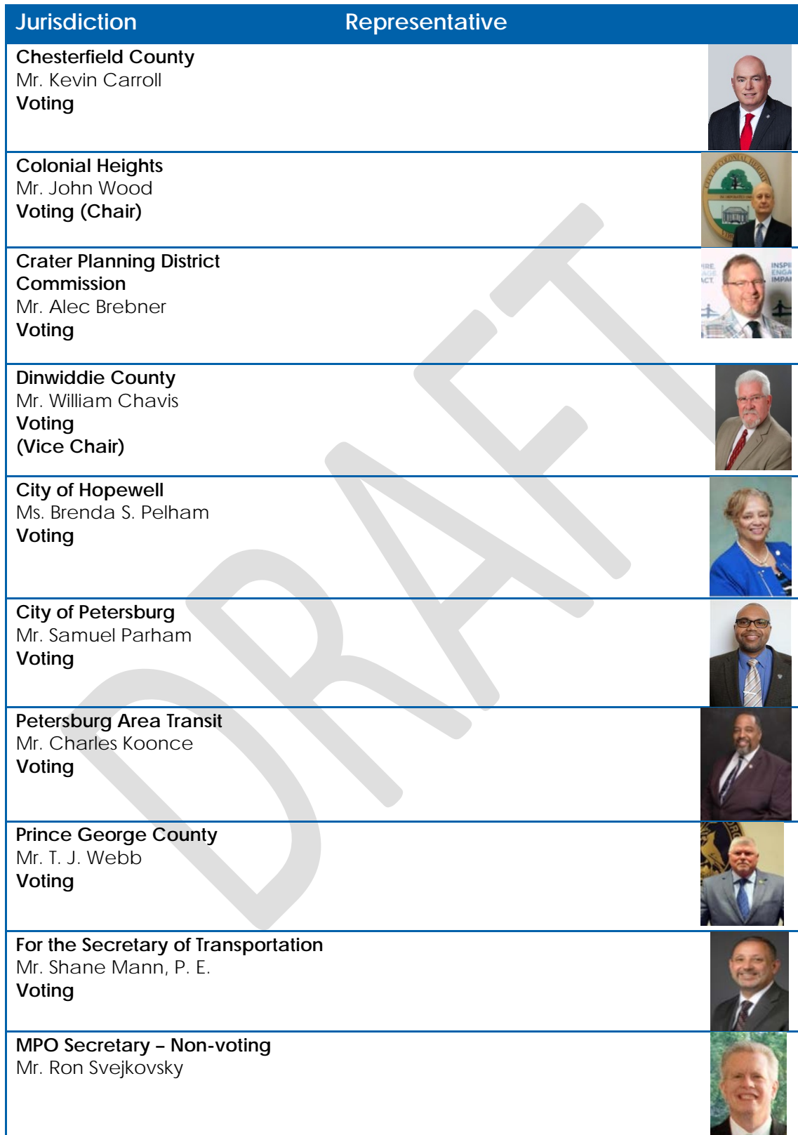
Table 1: Tri-Cities Area MPO Policy Committee Members