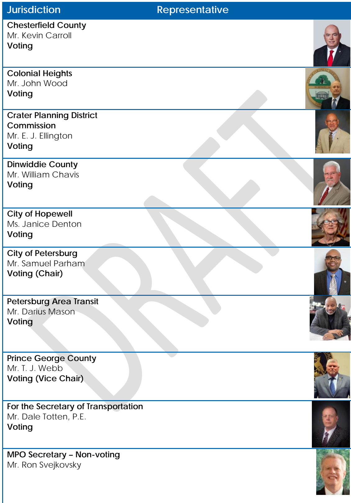
Table 1: Tri-Cities Area MPO Policy Committee Members