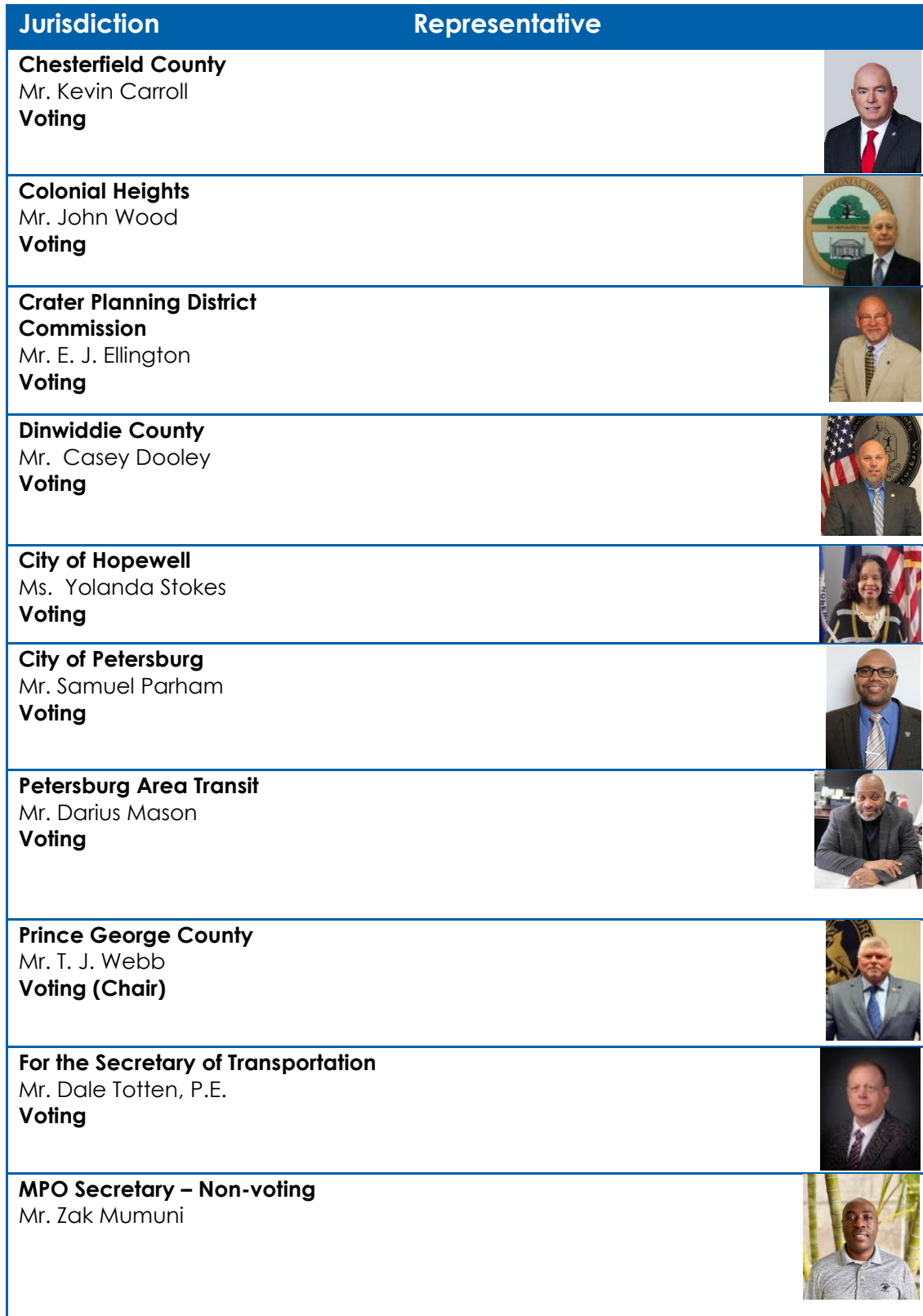
Table 1: Tri-Cities Area MPO Policy Committee Members