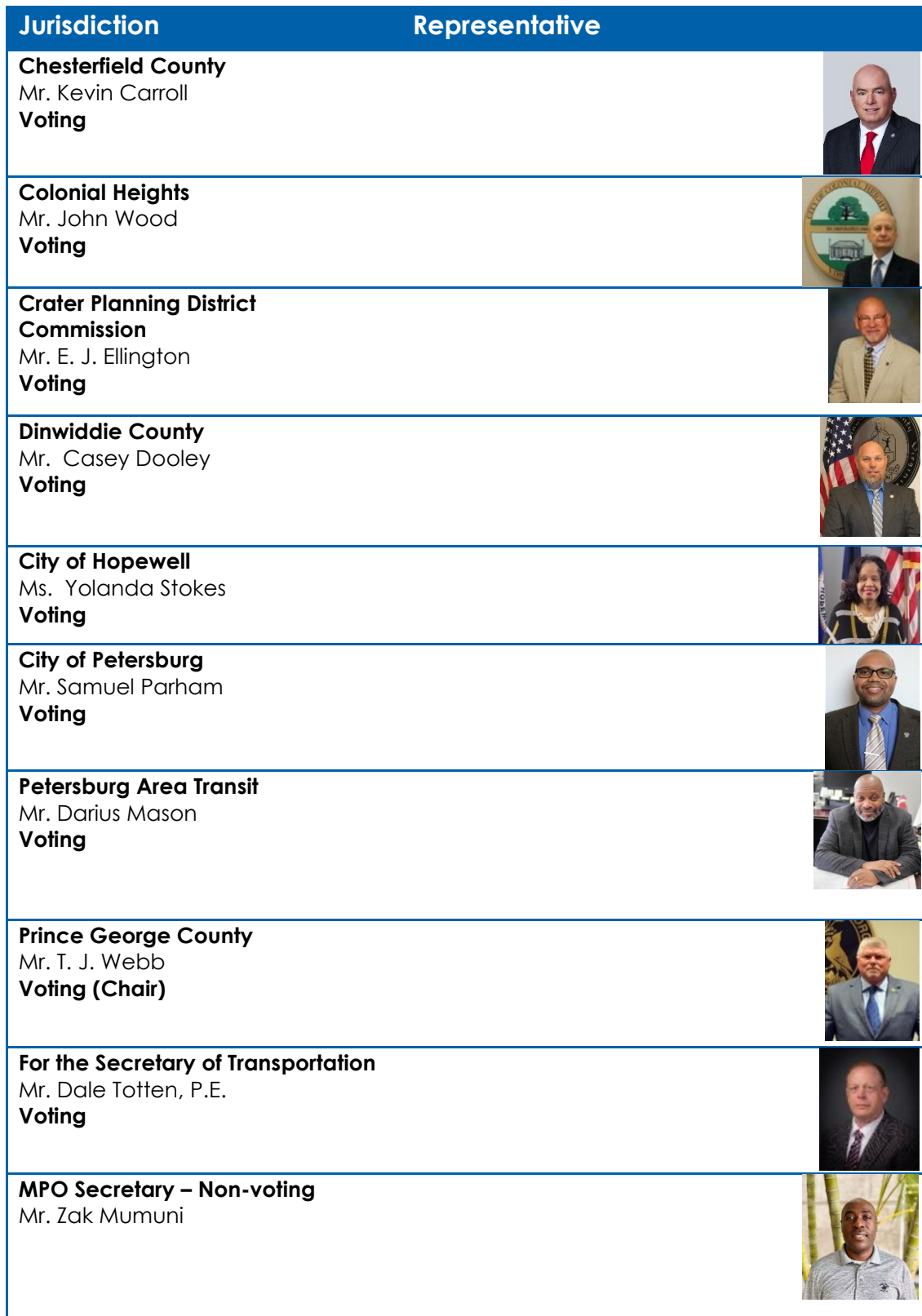
Table 1: Tri-Cities Area MPO Policy Committee Members