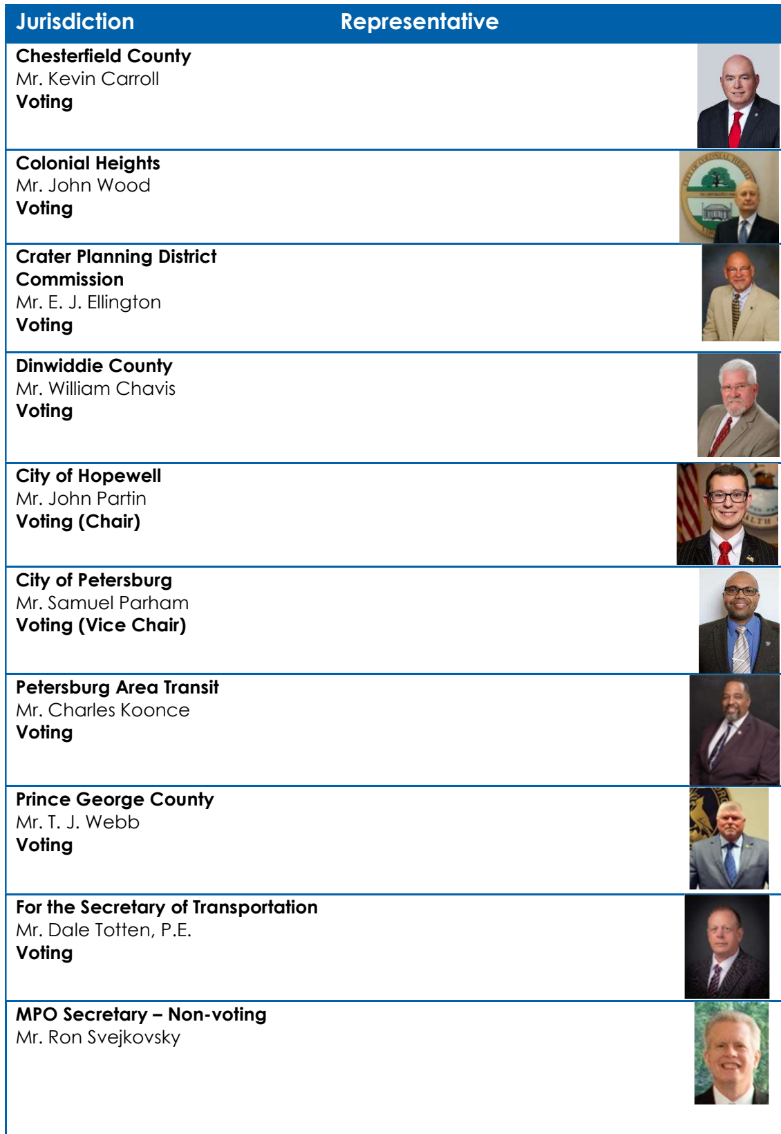
Table 1: Tri-Cities Area MPO Policy Committee Members